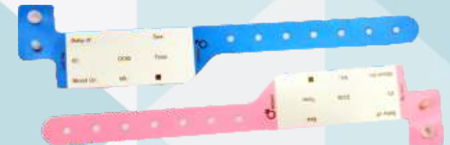
New Born Baby Tag