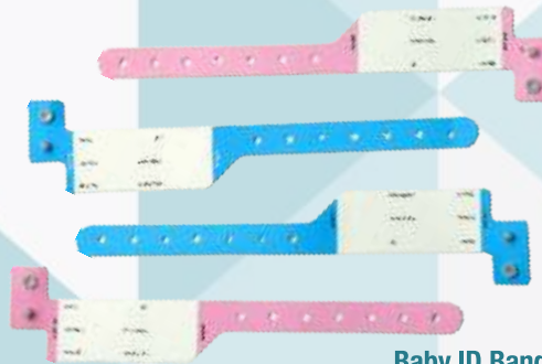
Baby ID Bands