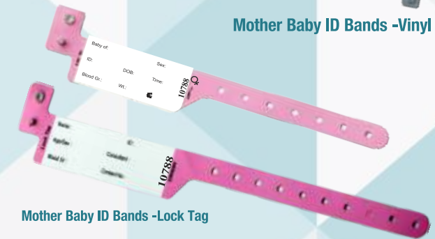
Mother Baby ID Bands -Lock Tag