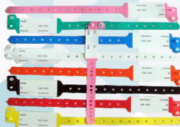
Imported Plastic ID Bands