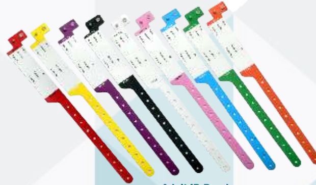
Adult ID Bands