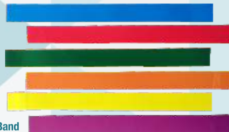
Event Band (without sr. no.)