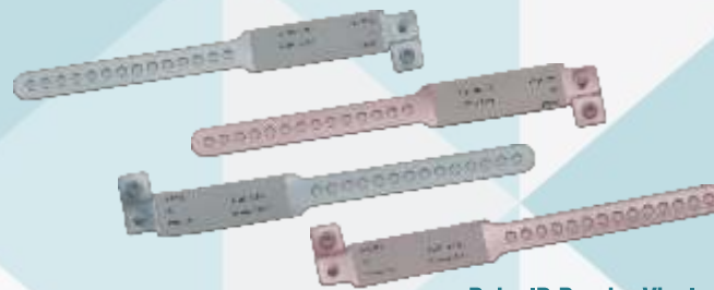
Baby ID Bands -Vinyl