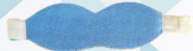
Eye Mask for Phototherapy