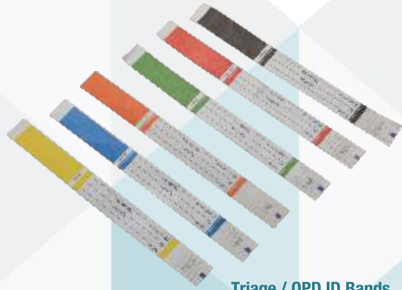
Triage / OPD ID Bands