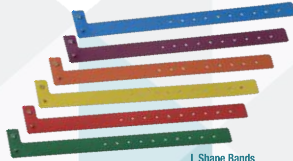
L Shape Bands